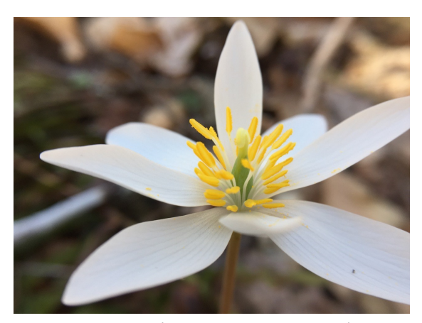
Bloodroot (Sanguinaria canadensis)