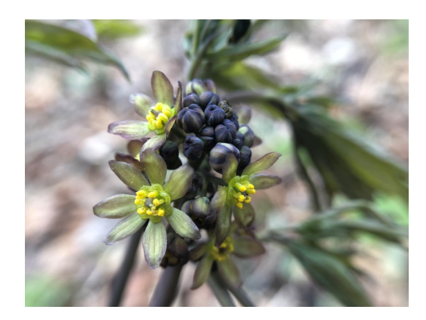
Blue cohosh (Caulophyllum thalictroides)

These programs are free but you MUST SIGN UP to participate. Call now (828 692-0100) or email holmesesf.ncfs@ncagr.gov to reserve your spot! Each guided hike will only last a few hours, but there is so much more to learn about and explore on your own time at Holmes ESF! We offer hiking trails, picnic areas and a variety of educational exhibits. Category II and III NC EE certification and CEU credit are available for participants upon request.